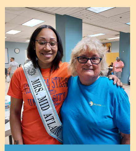
No Excuse for Abuse Walk with our Vice Chair