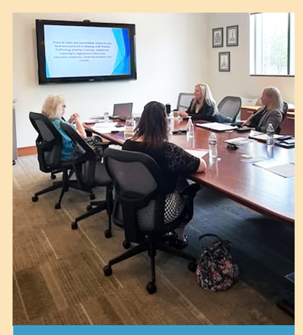
Focus Group Petersburg