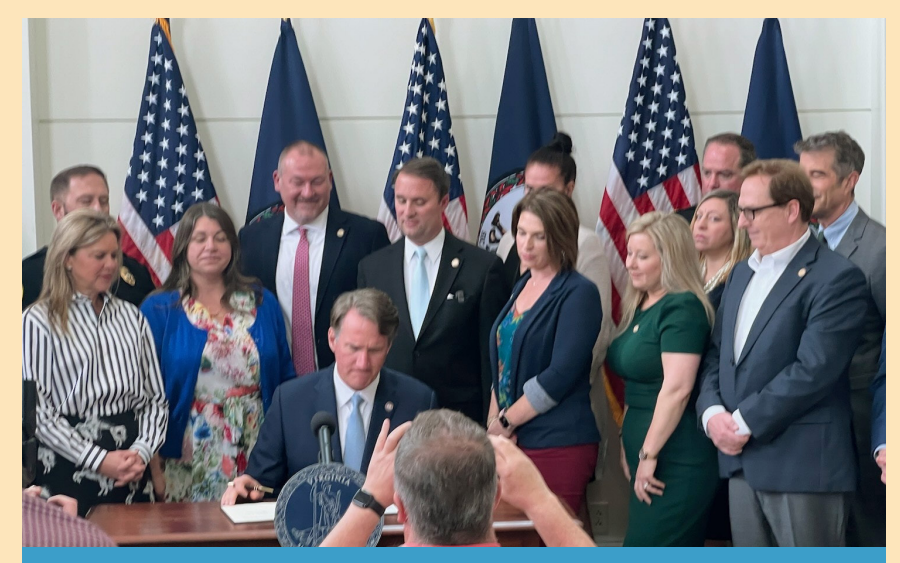
Governor Youngkin signing the first Labor Trafficking Law in Virginia