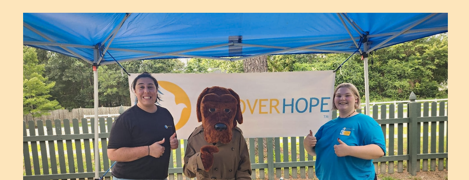
National Night Out Chesterfield Police